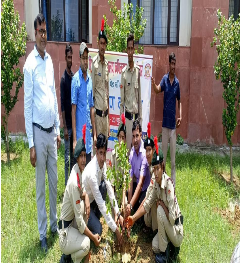
Plantation drive by NCC students on 20 July 2025