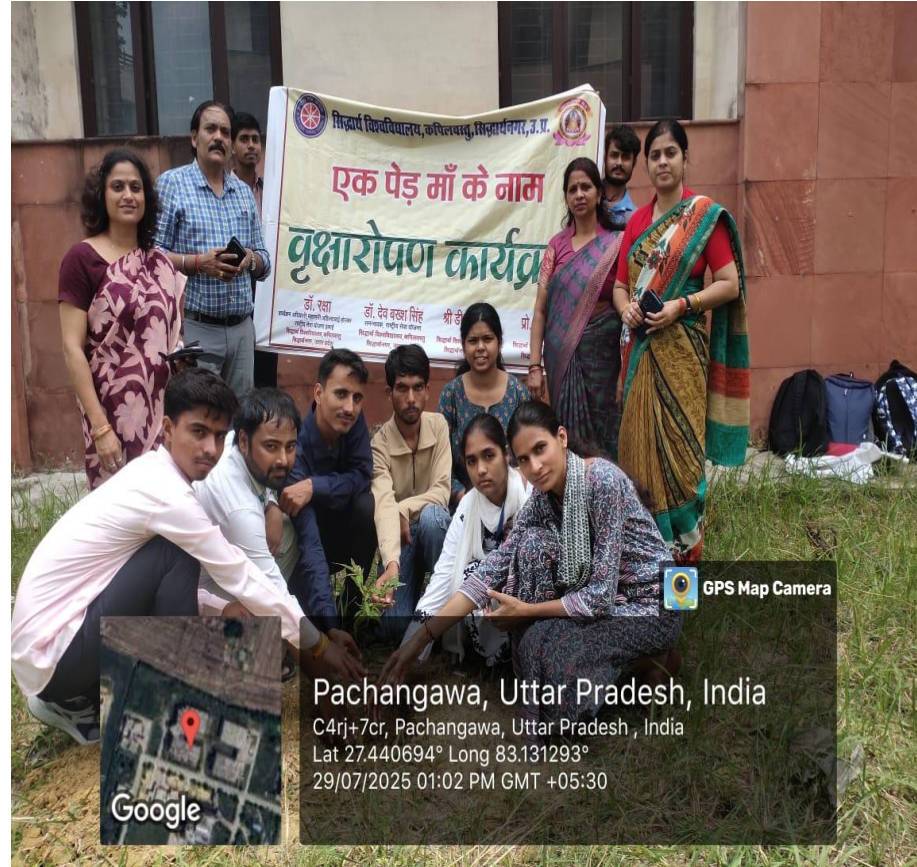
Plantation drive by NSS students on 29 July 2025